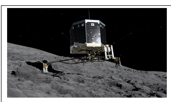
The Philae Lander drills into the Ducky Comet.

tricky business, especially if you've never done it before (and humans never have).