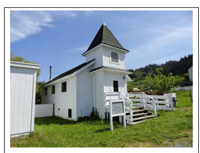
The Westport Community Church