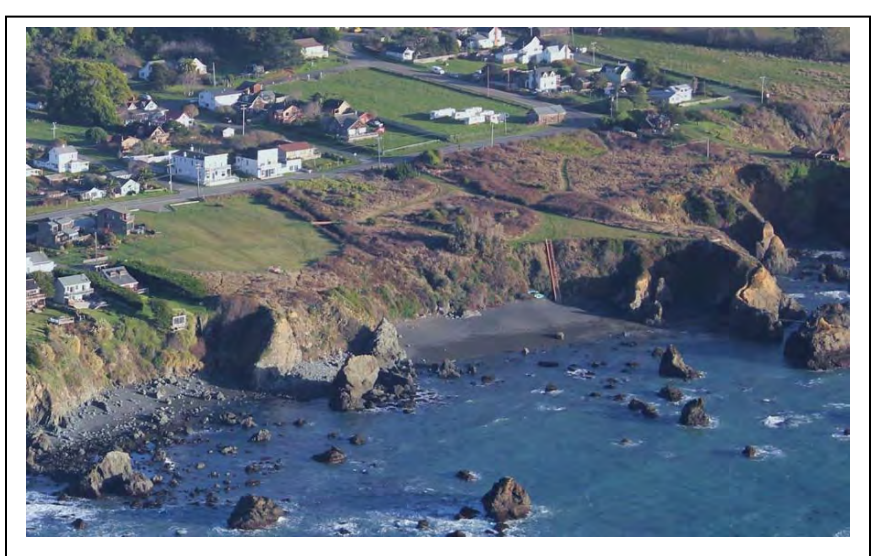
The Westport Community Headlands

So here's the plan. Beginning on February 21<sup>st</sup>, at 11:00AM on The Westport Headlands , and continuing on the 3<sup>rd</sup> Saturday of every month, I will lead a friendly discussion and walkabout that is open