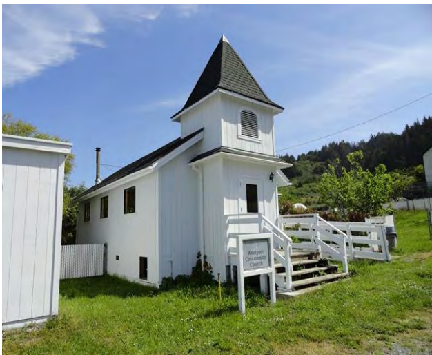
The Westport Community Church