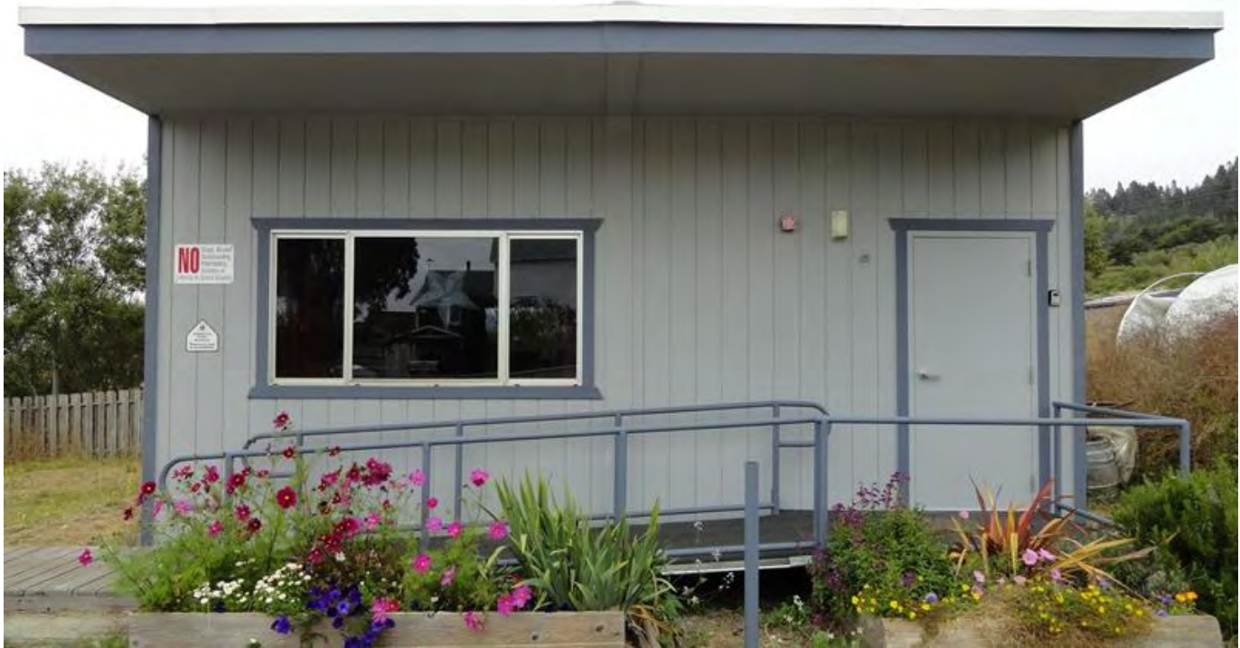
The Westport Recreation Center (formerly The Westport School)

for use of the property. This lease agreement commits the FBUSD to pay for all utility and maintenance cost associated with their use of the church property. The lease also requires a 60 day notice for changing and/or terminating terms of this lease agreement.