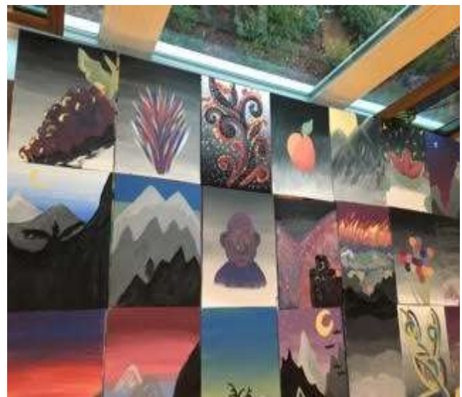
May Art Display at the Westport Hotel and Pub!