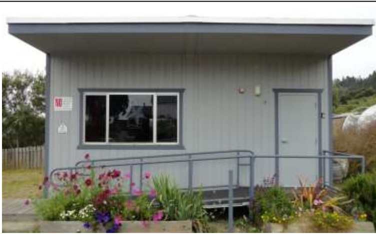
The New Westport Community Center