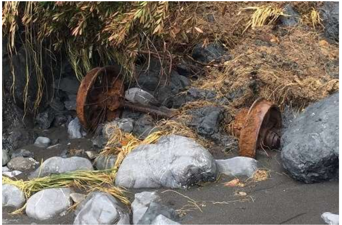
Railroad wheels north of Little Howard Creek in 2018.

On a recent beach walk north of Howard Creek, an old relic of the former railroad between Union Landing and the Howard Creek watershed was observed at the base of the cliff (see photo at right). This is not the first example of historic relics washing down the cliff. I've seen pieces of rail in previous