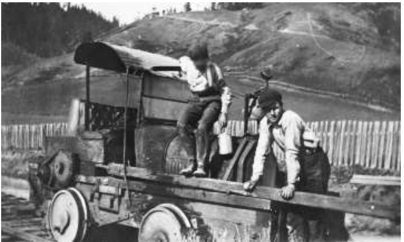
The McFaul's Studebaker 'locomotive' in 1919.