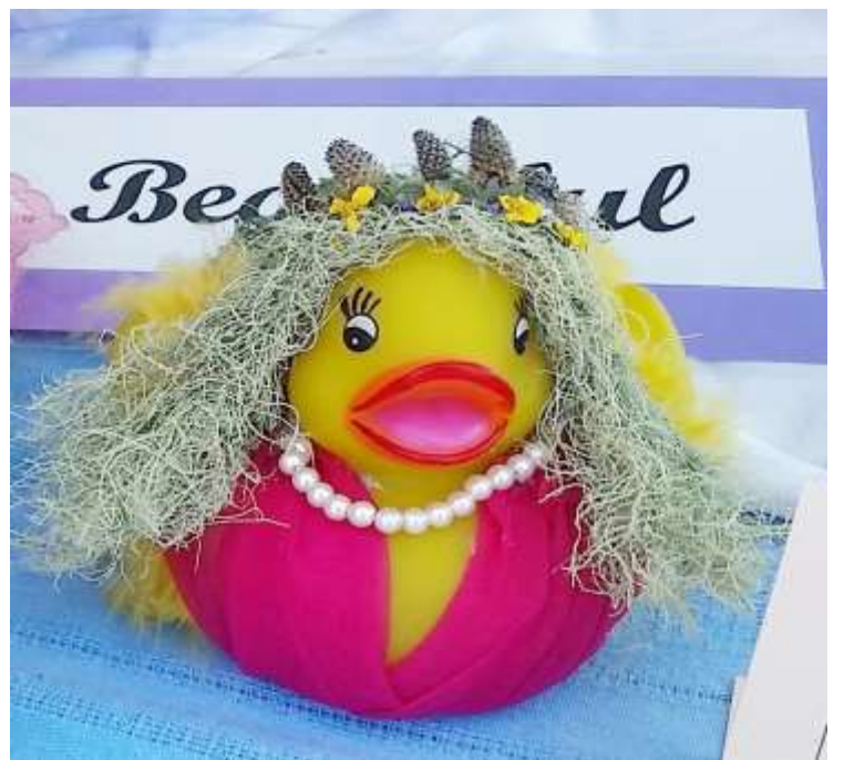
2017 Most Beautiful Duck Winner Monica Duckwinsky