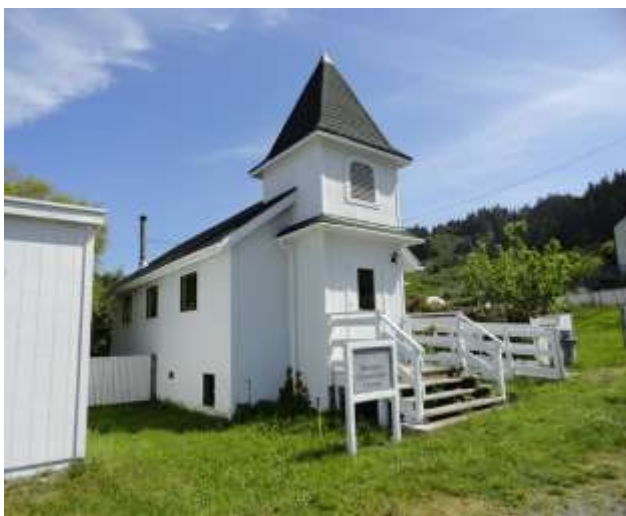
The Westport Community Church