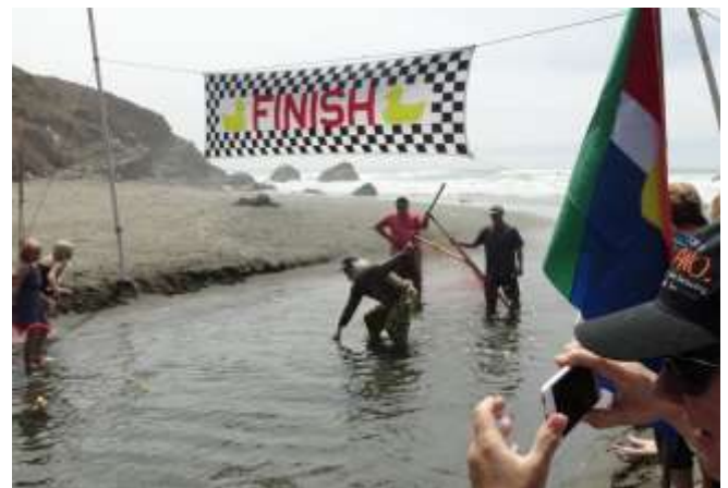
And The Winner Is...???