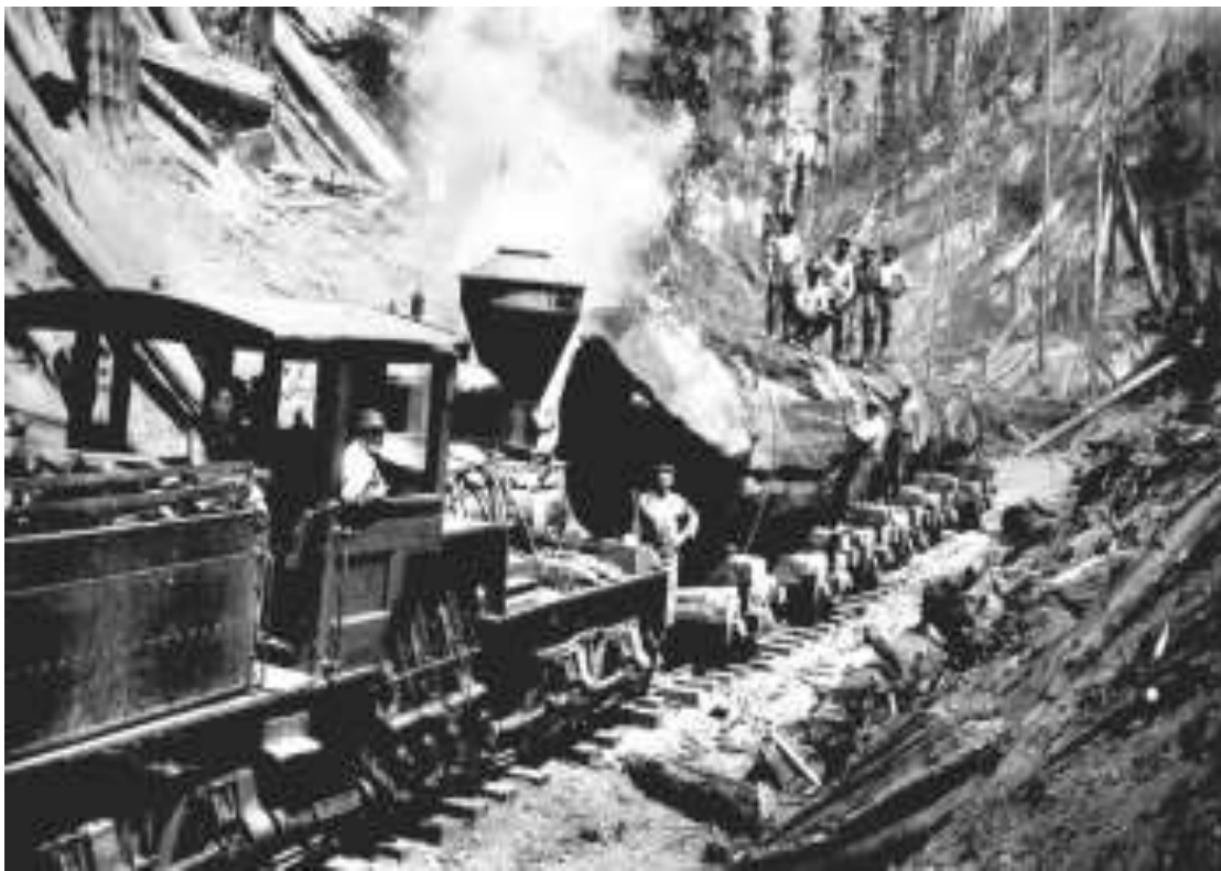
Shay locomotive up Howard Creek, ca. 1920.