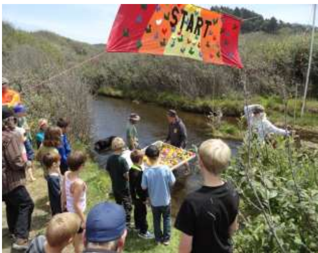
Ducks Ready To Go!