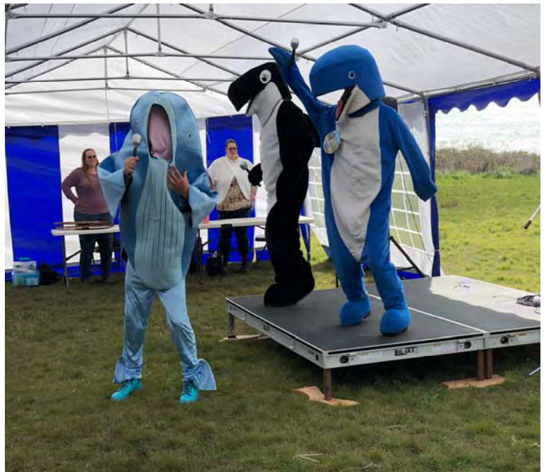
Live Shows as the Westport Whale Festival March 28 th !

This month's Westport Wave and over 8 years of monthly back-issues are always free to everyone at any time on the Newsletter page of our website www.westportvillagesociety.org – in living color, with live links! Check it out, and tell your friends!