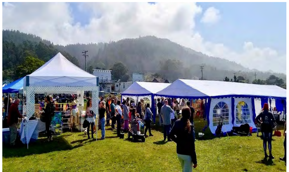
Come to the Westport Whale Festival on March 28 th !