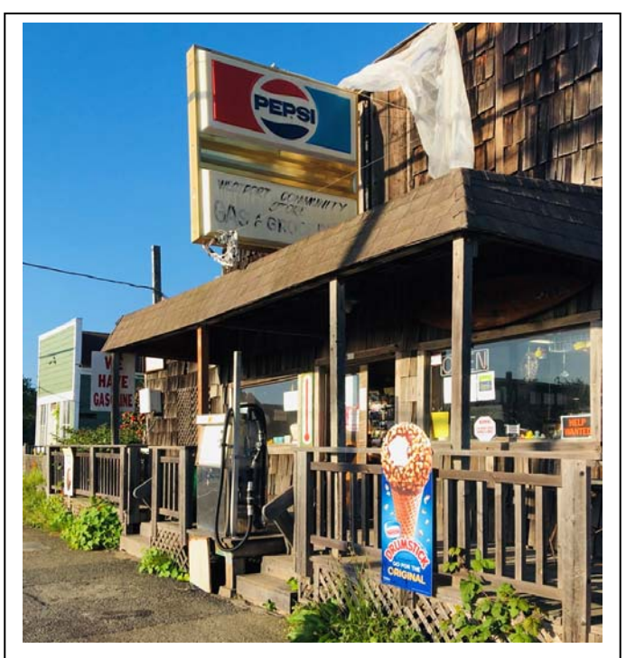
The Westport Store

The Westport Village Society urges you to take the opportunity to maintain your health with outdoor activities such as walking in the Headlands Park and other wild places. Our mission is to support land conservation and our community. We wish you good health and enjoyment of outdoor recreation opportunities as we weather this period of difficulty.