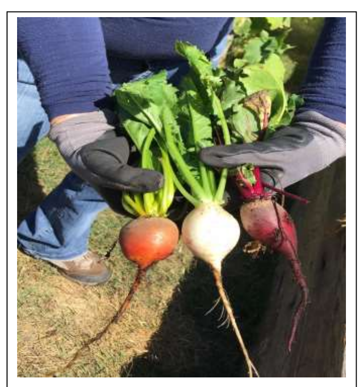
Fresh beets and other great veggies now at WCG!