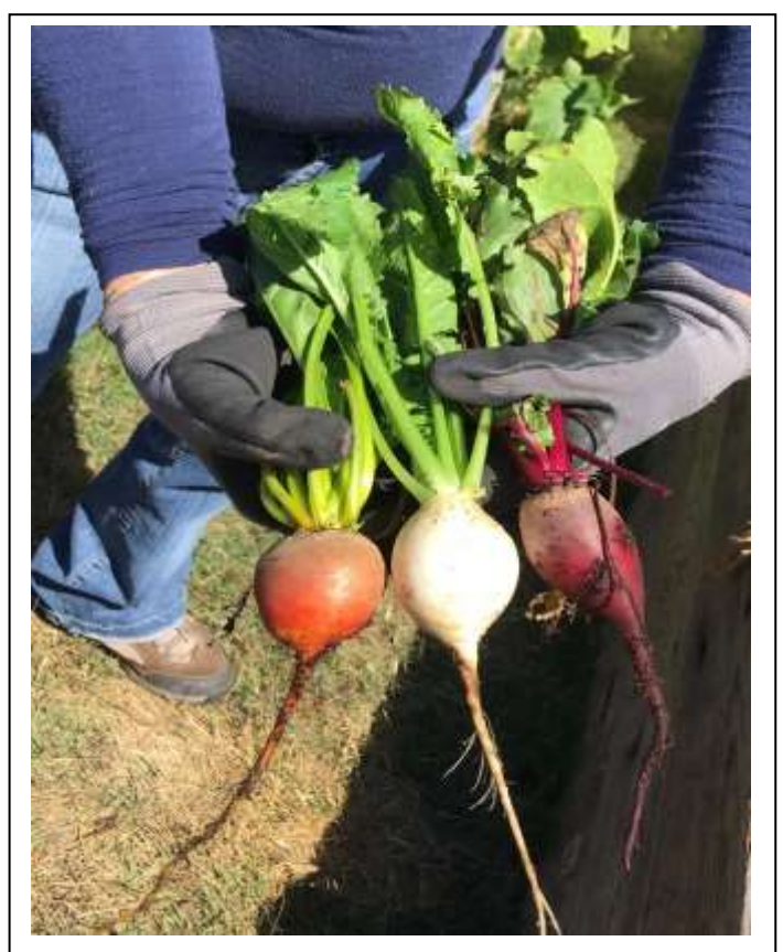
Fresh beets and other great veggies now at the Westport Community Garden!