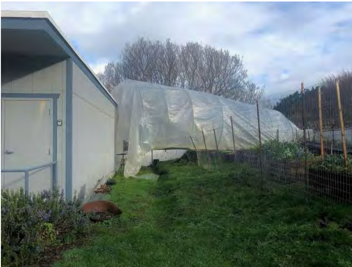
“HEY, THAT’S NOT WHERE IT GOES!” A late January storm impressively rearranged our greenhouse location, but we’ll soon put it back where it’s supposed to be!

but, that doesn’t mean there isn’t still work to be done in order for us to have a bountiful growing season. As usual, the community garden work days are the first and third Saturdays of the month (weather permitting). If you’re free and care to join us for a few hours some Saturday in the garden we just ask