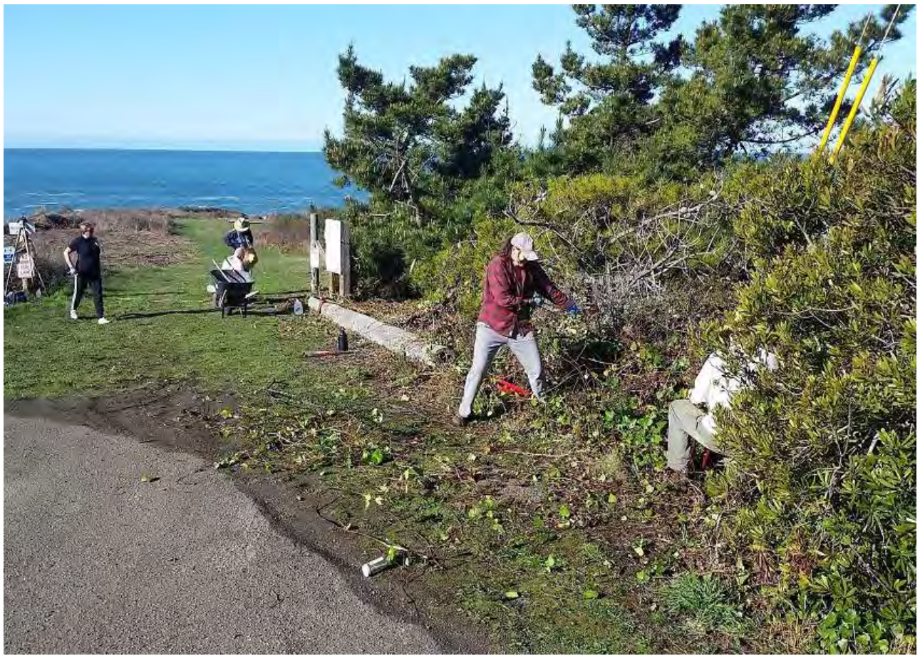
Volunteers clear invasive plants and fix the gate at the south entrance to Westport Headlands Park.