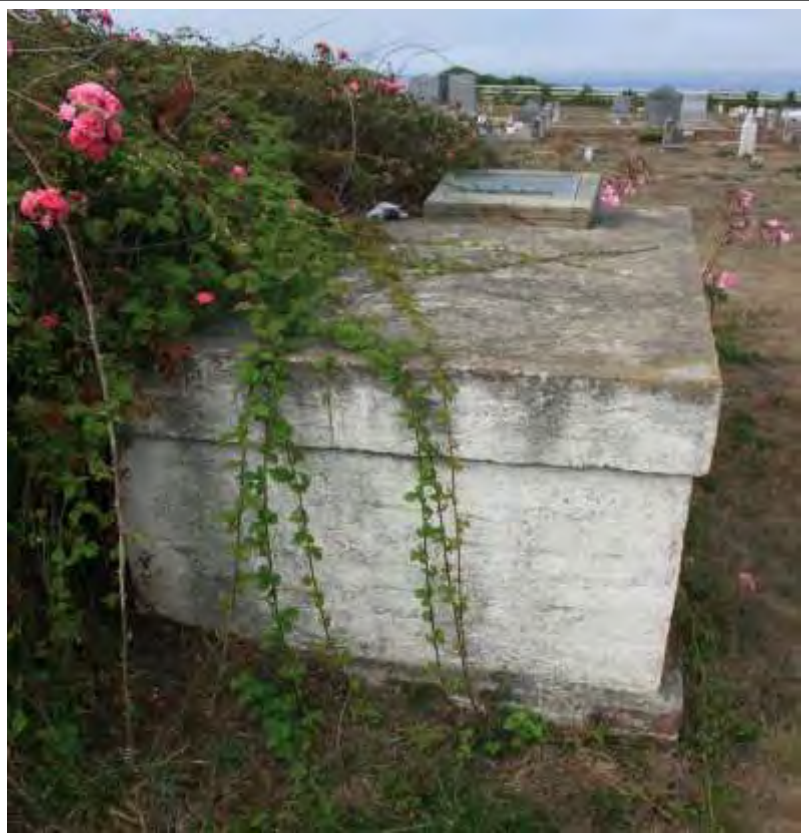
A few years ago, a large rose bush covering the burial vault was cut back, so the vault is more visible now.