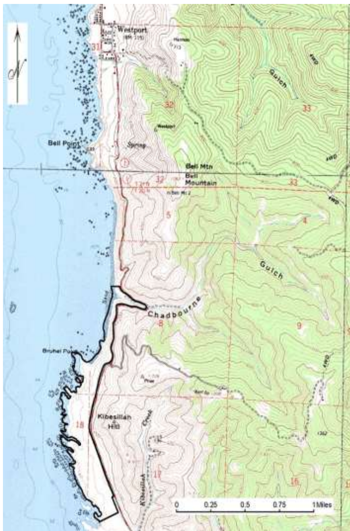
Lilem (outlined in black, lower left on map)

Can you visualize our modern community devastated to that extent? It's unimaginably horrific.