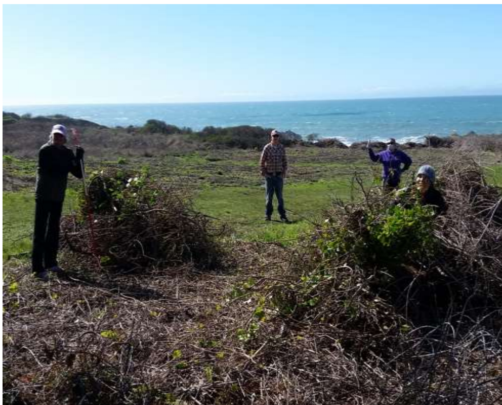
Headlands volunteer work crew clearing invasive English Ivy February 20 th .