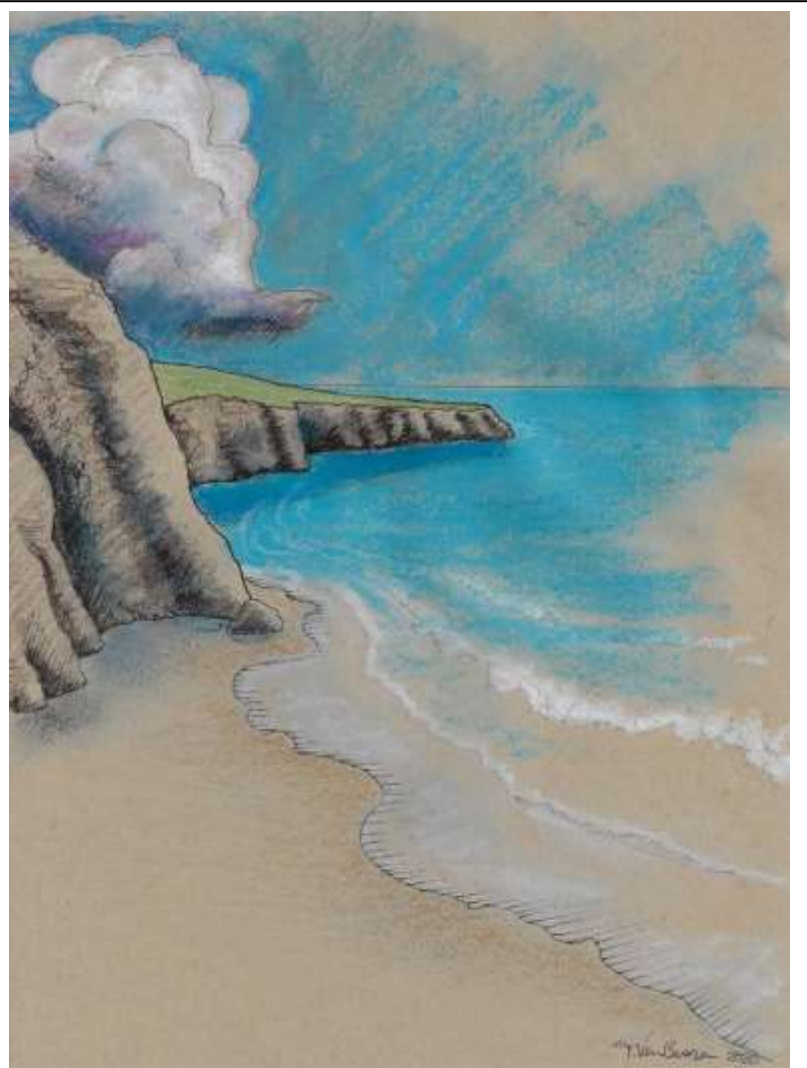
Artwork by Thad Van Bueren

Every Epûs hamlet was an independent community, with ties among villages formed by trade and intermarriage. Of particular interest for this tale is the mussel rock people who called themselves Mishkeun . They had several villages including K'etim and Lilem on the coastal plain near the mussel shoals south of Westport. Their village of Kasolak was on the ridge east of that. Mishkeun lands extended inland to the Little North Fork of the Ten Mile River