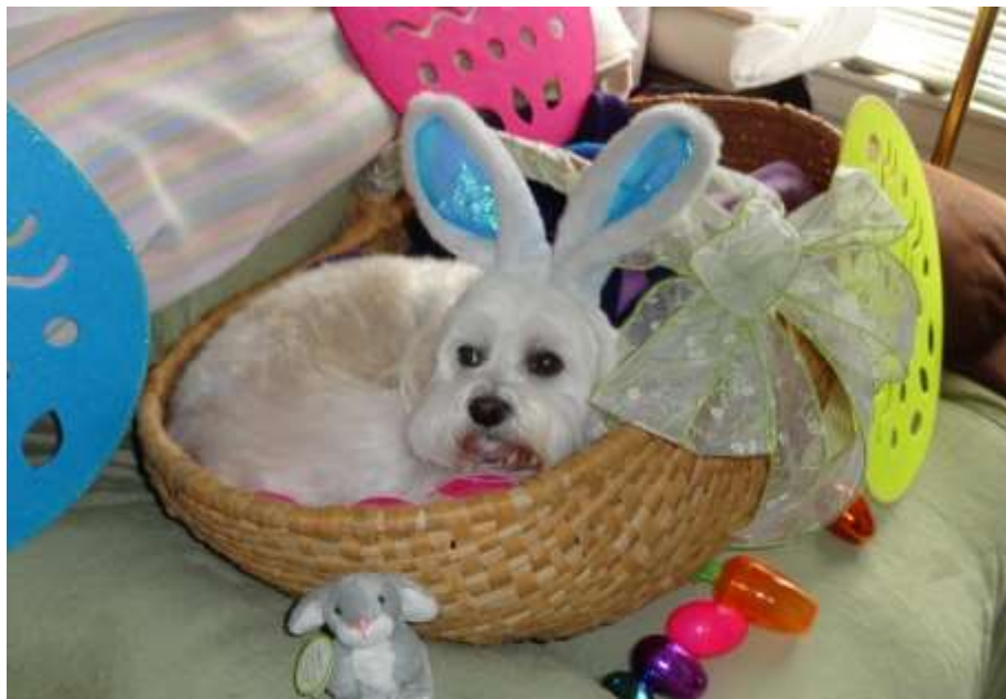
HAPPY EASTER FROM MARTY AND ALL YOUR FRIENDS AT THE WESTPORT WAVE!