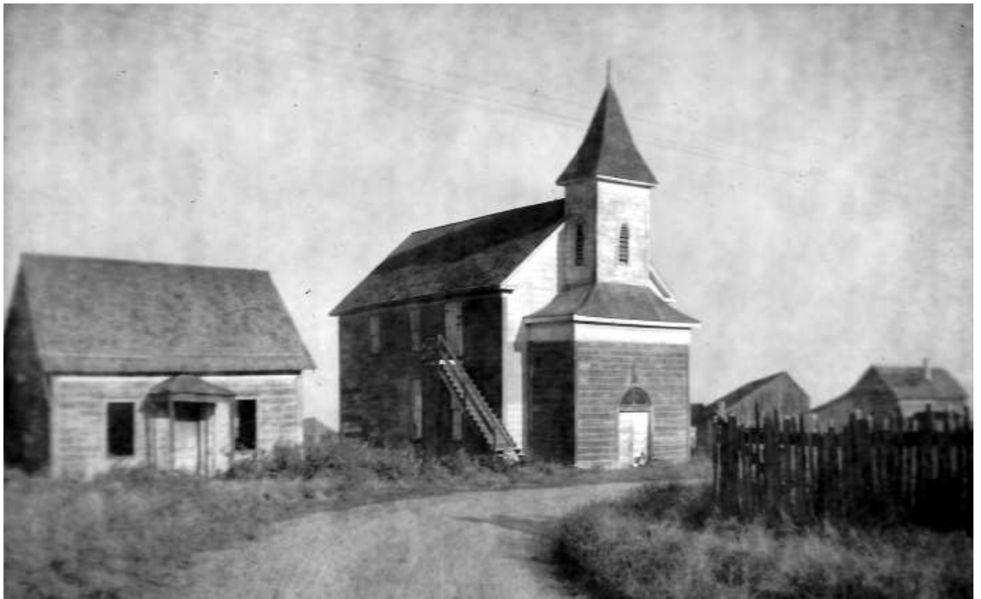
The Westport Church On Pacific Avenue (photo by Edmond Gross in 1940)