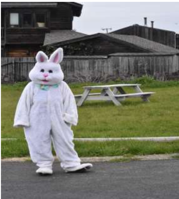
Easter Bunny sighting in Westport April 4 th !