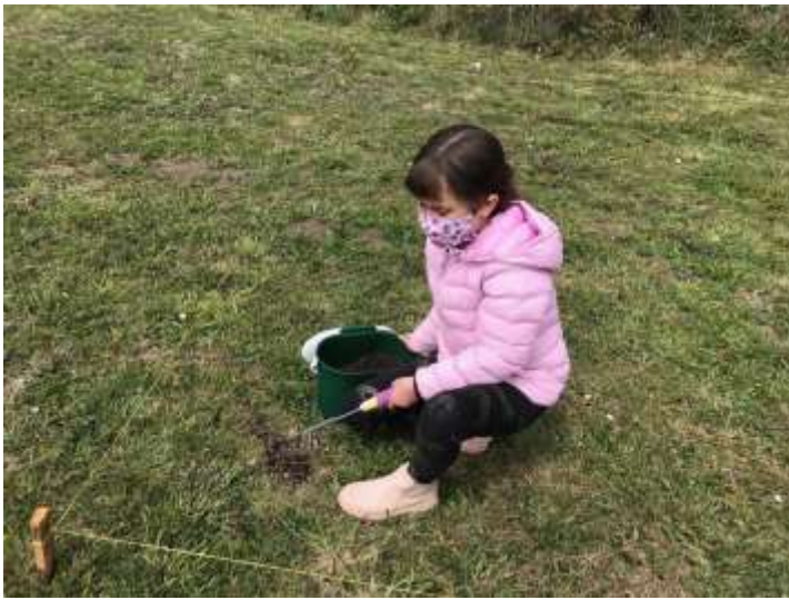
Planting wildflowers on the Headlands in April.