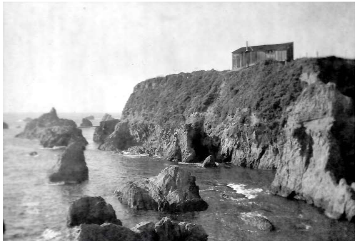
The Westport Headlands, July 1940

In my mind the biggest, most important opportunity and also probably the most difficult challenge is having the two cultures work together on a solution. Westport is the physical hub for this activity. This is a chance for Westport to reach out and link with other local communities, both geographic and cultural. I also suspect that this is one of those once in a lifetime opportunities. I hope that the WMAC, WVS, and the