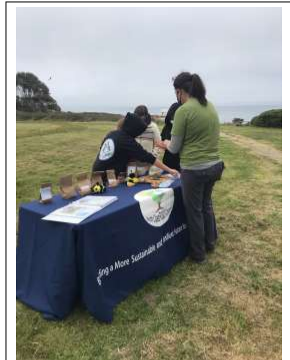
Bee Patch information booth.

We hope that the Westport community feels that this project supports your goals for preservation and stewarding the beautiful Westport Headlands site.