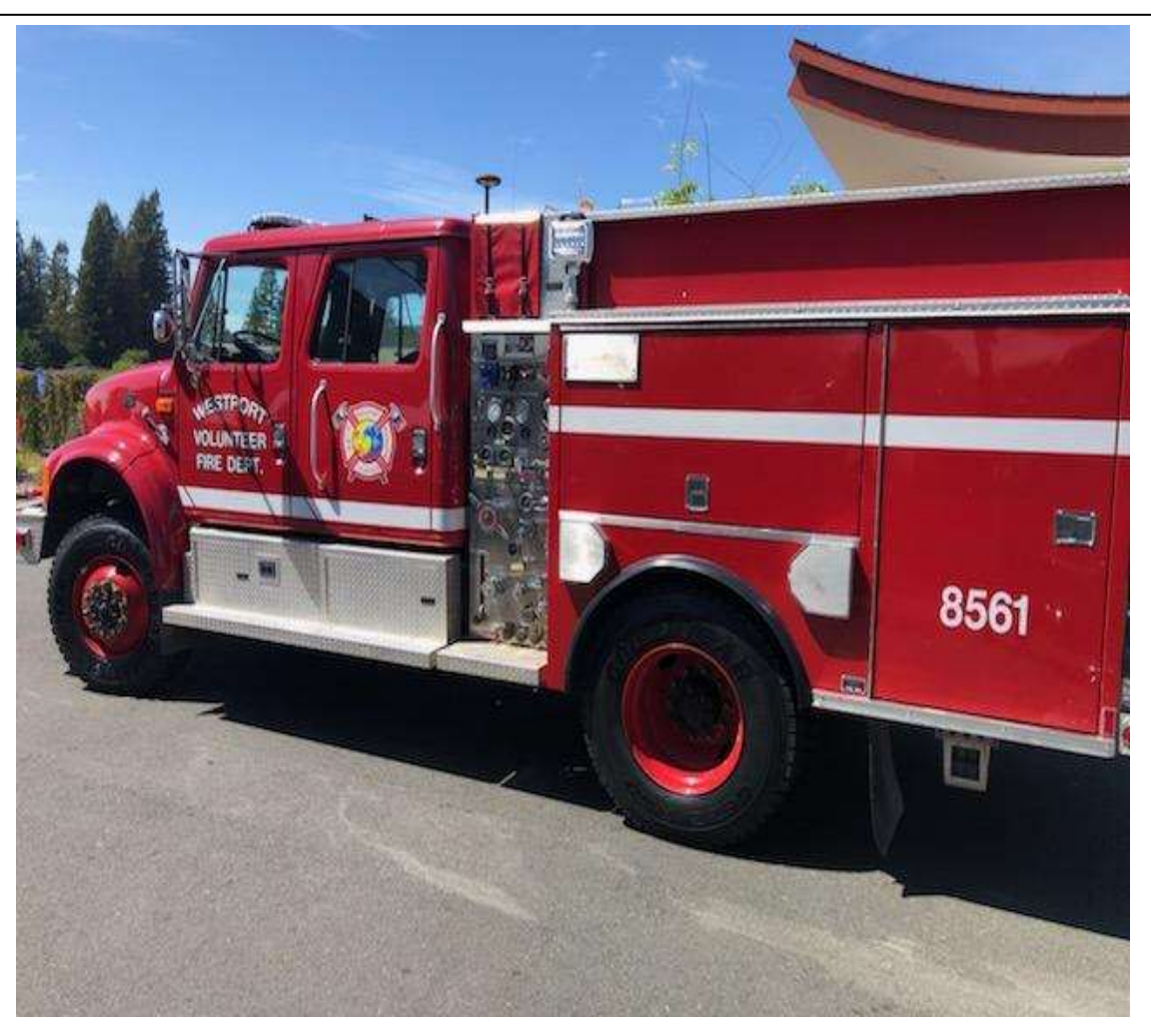
The new WVFD Engine #8561 will be the first engine out on most calls.

We are very grateful for our community's ongoing support of our operations, especially as we approach what could be an active fire season.