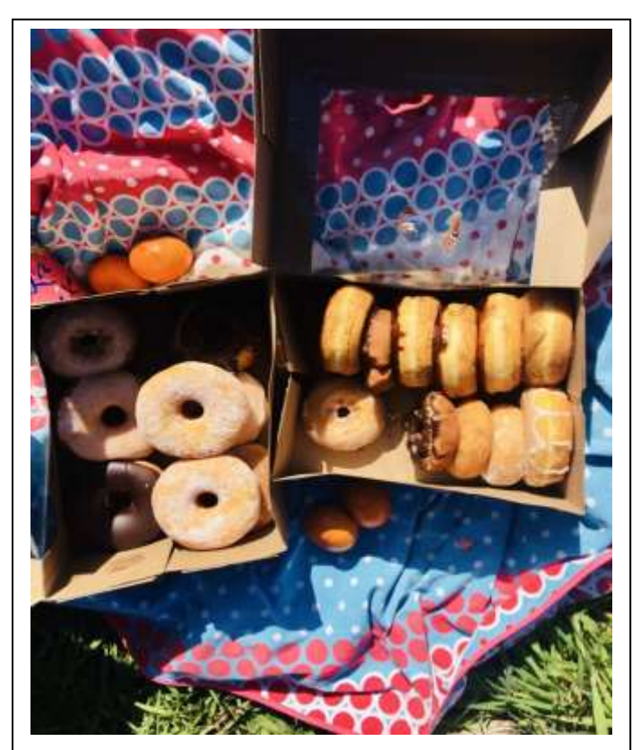
Treats available at the monthly Westport Headlands Work Party!

ocean, and each other's company. Before the work parties, I didn't know these guys, and they are truly treasures in our community. Friendly, knowledgeable, and so tireless, they put me to shame.