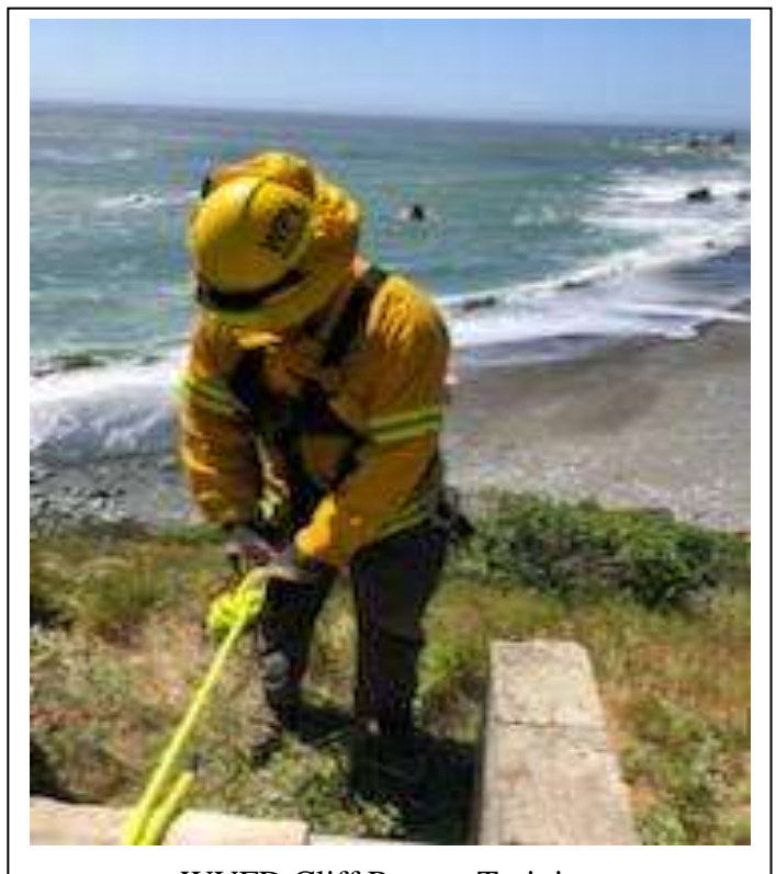
WVFD Cliff Rescue Training

We are currently completing the paperwork for a new ISO (Insurance Services Office) survey that we anticipate a little later this year. Our last survey, in 2014, led to an improved ISO rating of 05/5X. Since a Department's ISO rating can affect the availability and cost of fire insurance, we would like to improve our rating from 05 to 04, or even to 03 (under the ISO rating system, a lower number is better). One of our challenges is that the hose testing machine we had been borrowing from Fort Bragg Fire is no longer available. We are trying to raise money to buy a hose testing machine of our own. With sales tax and shipping the most economical dependable hose