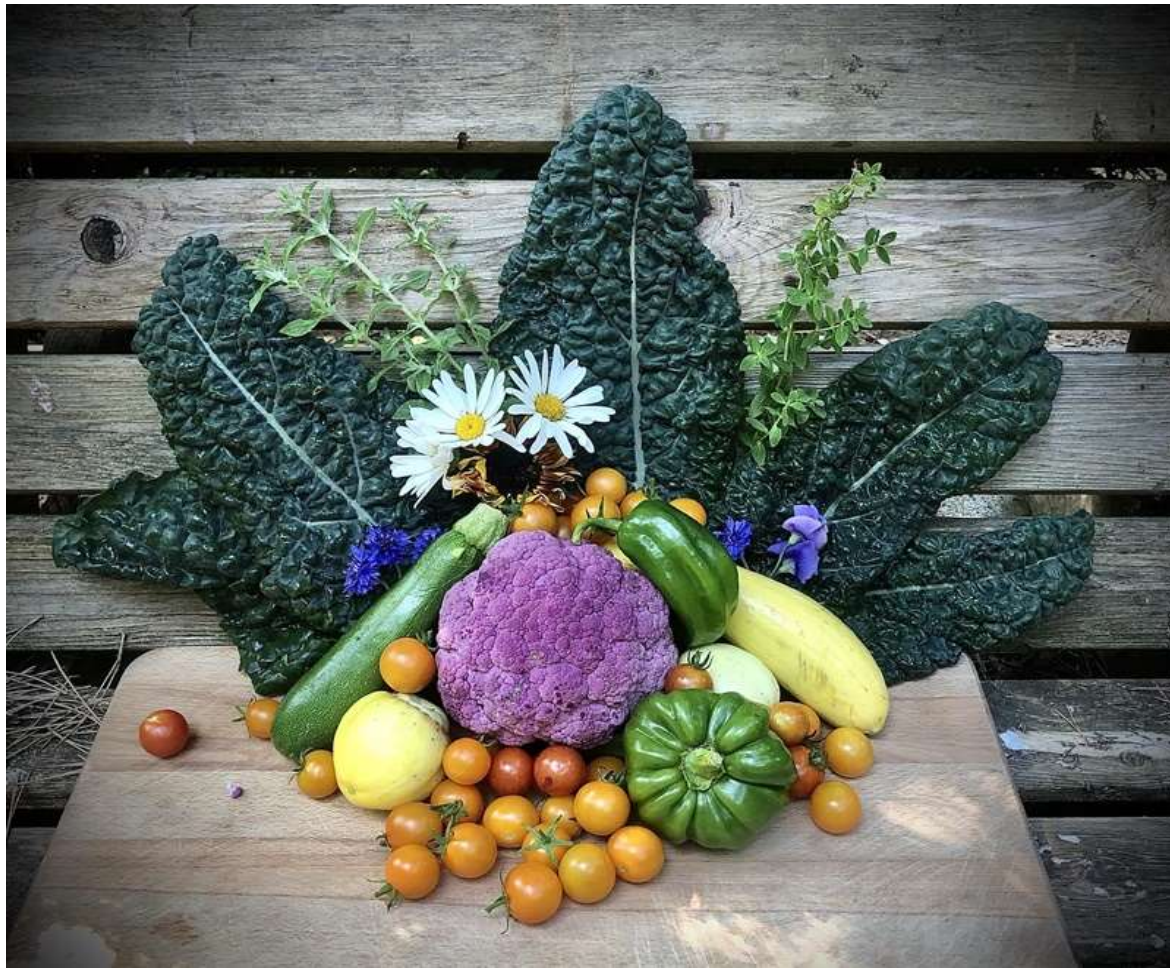
Beautiful Westport Vegetables!

and peppers (the raised bed on the left contains sweet peppers and the one on the right contains hot peppers). Lettuce, spinach, kale, peas, squash, and a variety of different herbs are all ready for you to harvest as well. We will be planting our cool-weather crops early this month, which will include brassicas, greens, and even more peas, so keep checking them to see their progress.