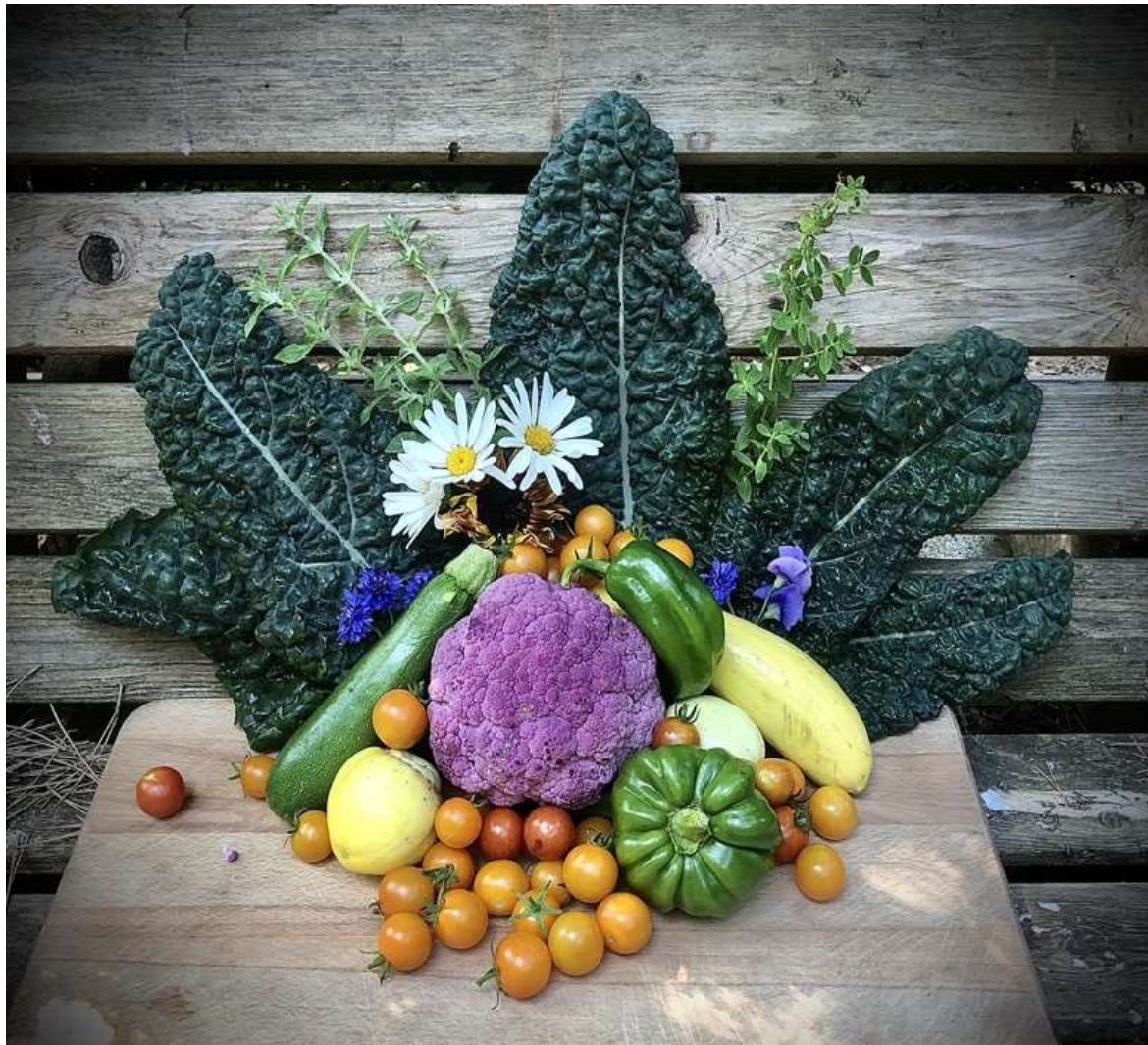
Beautiful Westport Vegetables!

contains sweet peppers and the one to the right contains hot peppers) so make it up there to pick some if you can! I've been using a food dehydrator to make "sun-dried" tomatoes and, boy, are they good! Last month we managed to plant some more lettuce, spinach, and kale in the raised beds outside the greenhouse, and as more stuff starts to die off in the greenhouse we will continue to plant our cool weather crops for the winter months there as well.