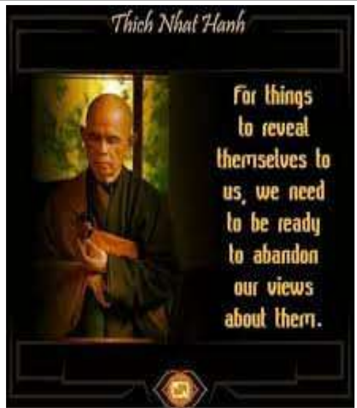
Teacher Thich Nhat Hanh October 11, 1926 – January 22, 2022 A Cloud Never Dies

The Westport Wave is always free to everyone at any time on the Newsletter page of our website westportvillagesociety.org – where you’ll always find our most current issue as well as over ten years of monthly back-issues, all in living color, with live links! Check it out, and tell your friends!