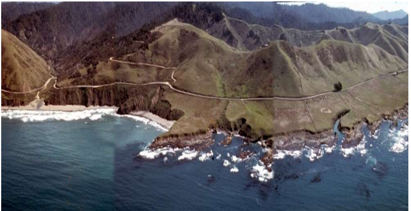
Blues Beach area, 1972 – three years before Caltrans acquired it through conservation funding