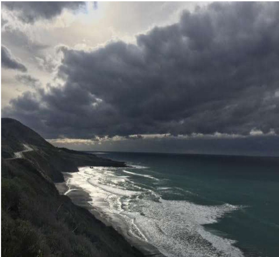
View of Blues Beach, January 2022

Once all milestones have been completed to the satisfaction of the oversight agencies, the transfer can then take place. Protective covenants will be part of the deed transferring the property to the tribal nonprofit. Those covenants will address all the requirements in SB 231. The final management plan will be made available to the public.