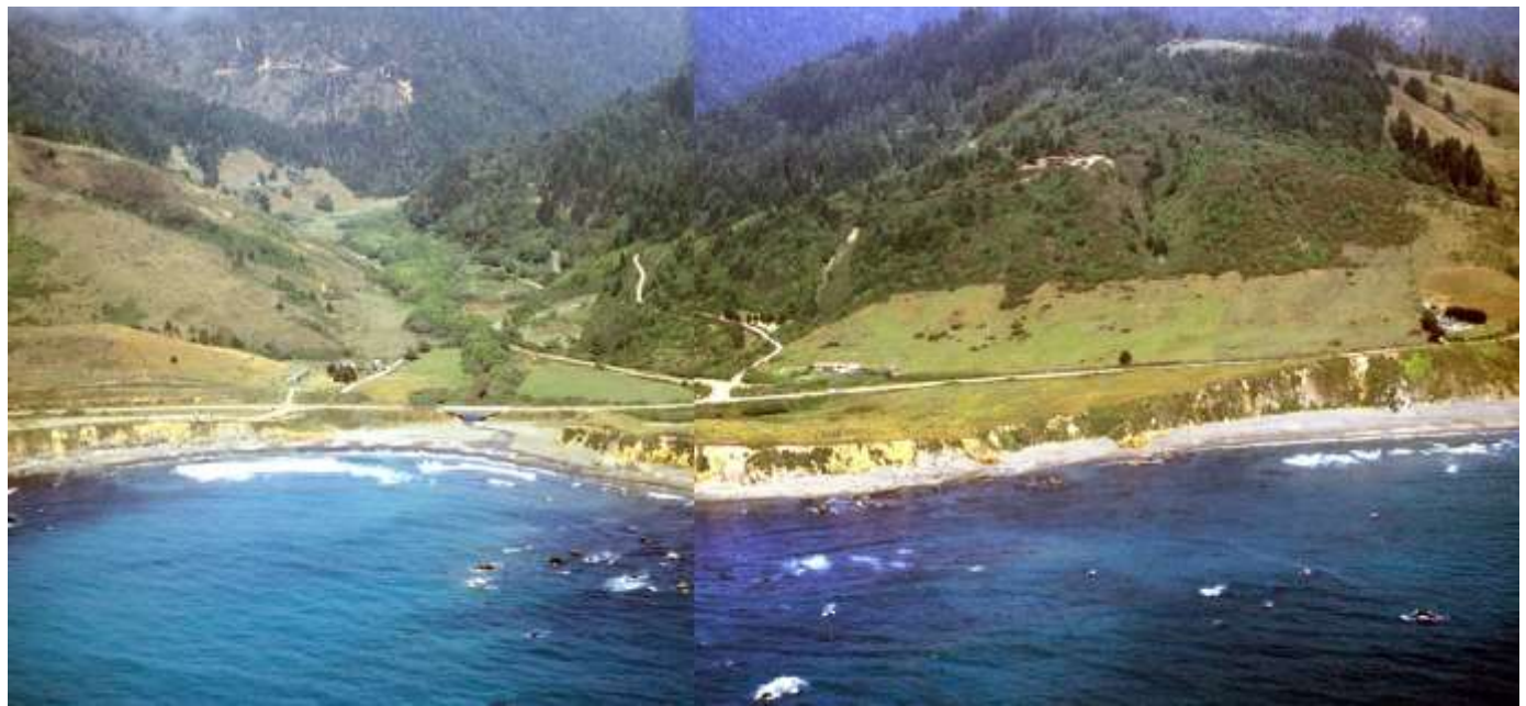
The Dehaven Headlands

Published by the Westport Village Society, P. O. Box 446, Westport, CA 95488