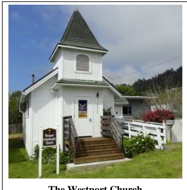
The Westport Church