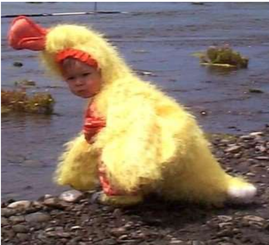
Ducky Races 2005