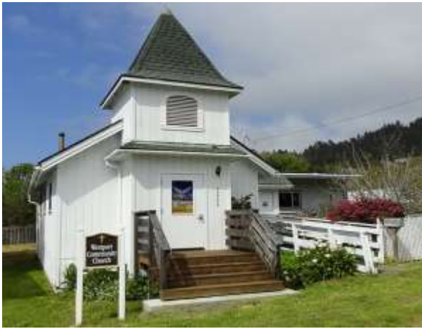
The Westport Church