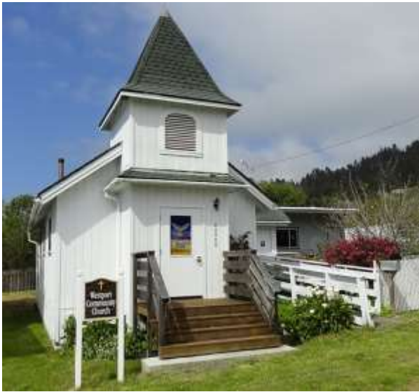
The Westport Church