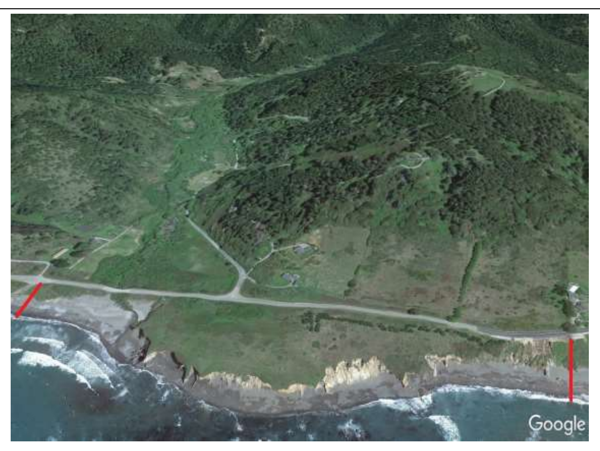
2019 view of DeHaven Creek and Headlands facing east.

The Westport Village Society has completed a grant application to acquire and plan future management of the DeHaven Creek and Headlands property. The budget for the grant includes the land purchase. additional studies, public