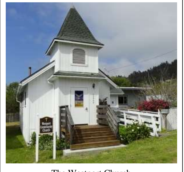
The Westport Church