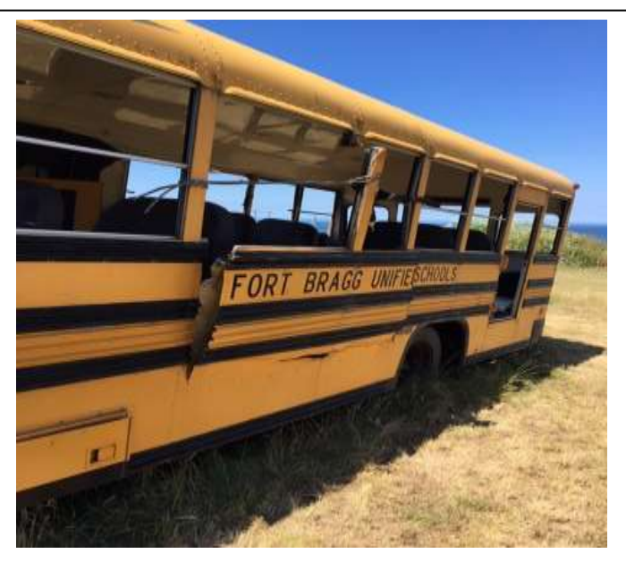
Some people remember riding on this old FBUSD bus, now donated for WVFD emergency training.