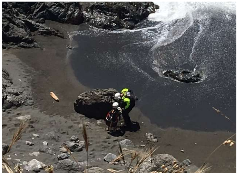
...And a real helicopter rescue the very next day.

nobody was injured. We assured the group that more resources were on the way and gave the group instructions on how to stay safe.