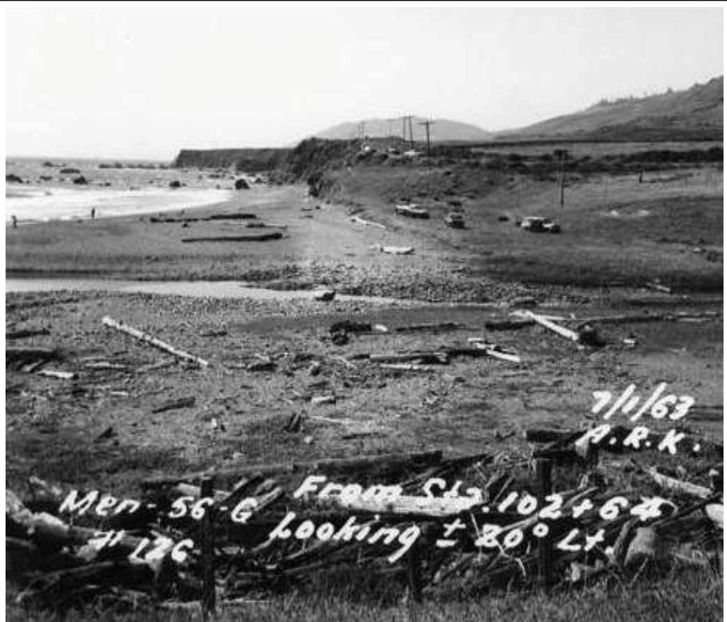
1963 view of DeHaven beach facing north before the highway realignment (courtesy of Caltrans).

WVS submitted a grant application in July to acquire and plan future management of the DeHaven Creek and Headlands property. We believe our grant application is competitive because WVS is contributing both funds and donated services. The California Coastal Conservancy will meet in Fort Bragg at the Town Hall on September 22 nd to consider that grant request. They asked to meet supporters at the property on the afternoon of Wednesday September 21 st . Let's plan an Autumn Equinox gathering there to welcome