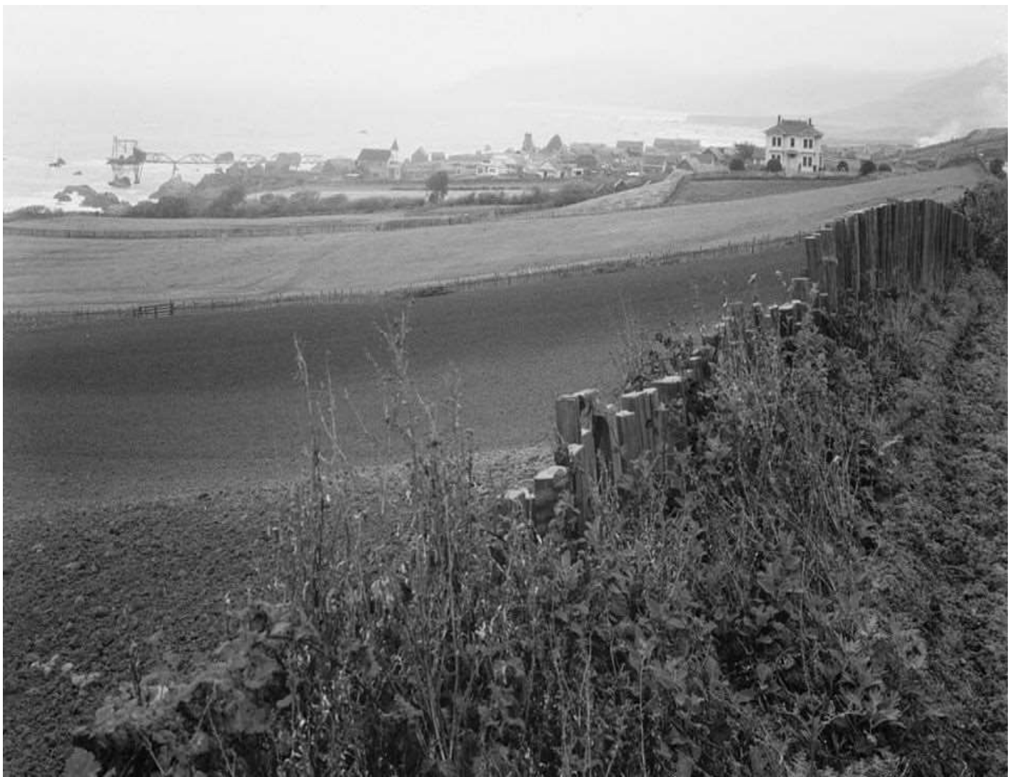
Westport in March 1934, photo taken by Roger Sturtevant from south of town.