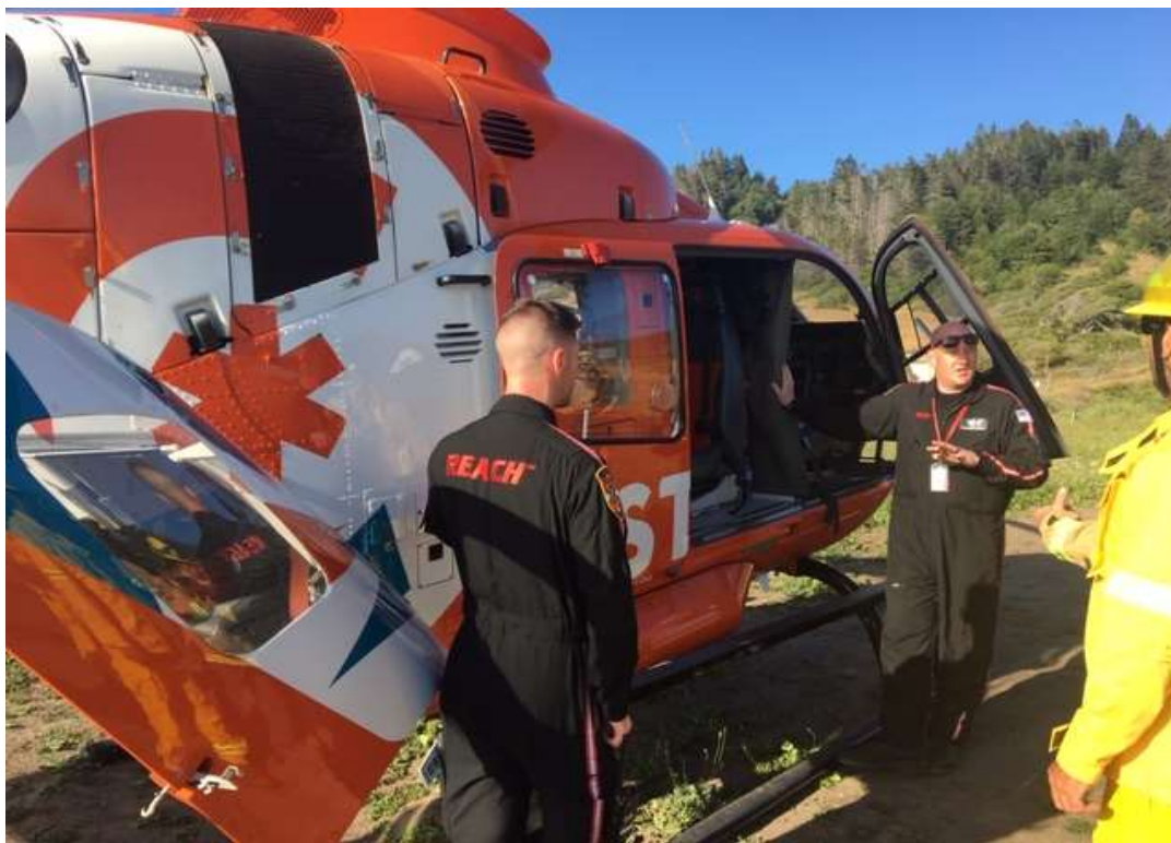
WVFD helicopter training on June 29 th ...