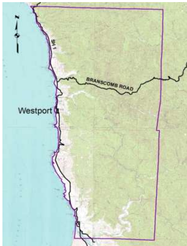
Membership area for the Westport Church