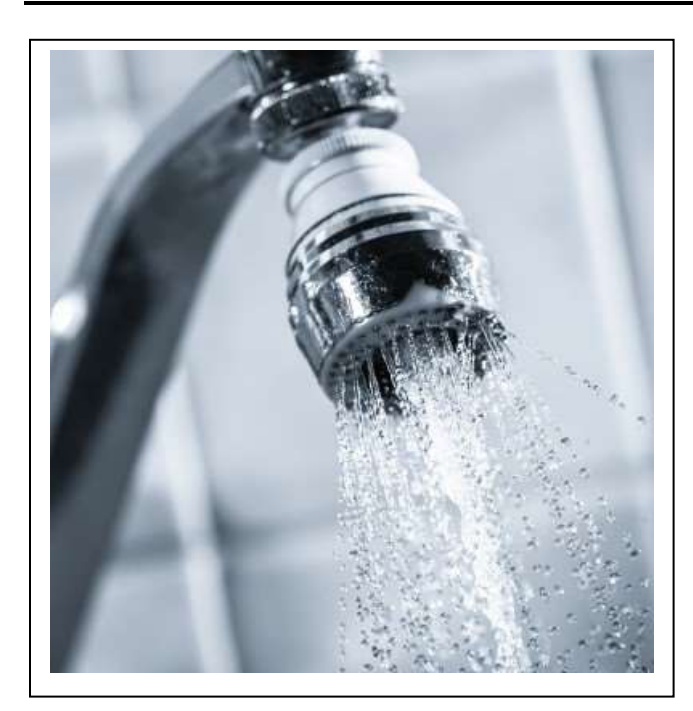
Westport County Water District News