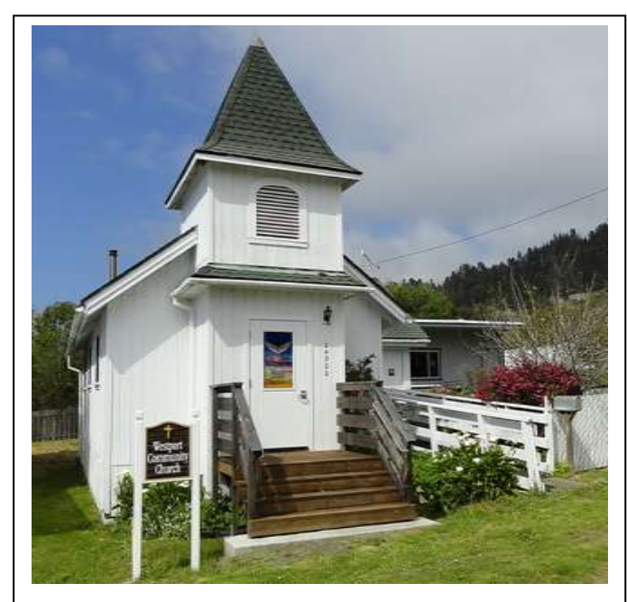
The Westport Church