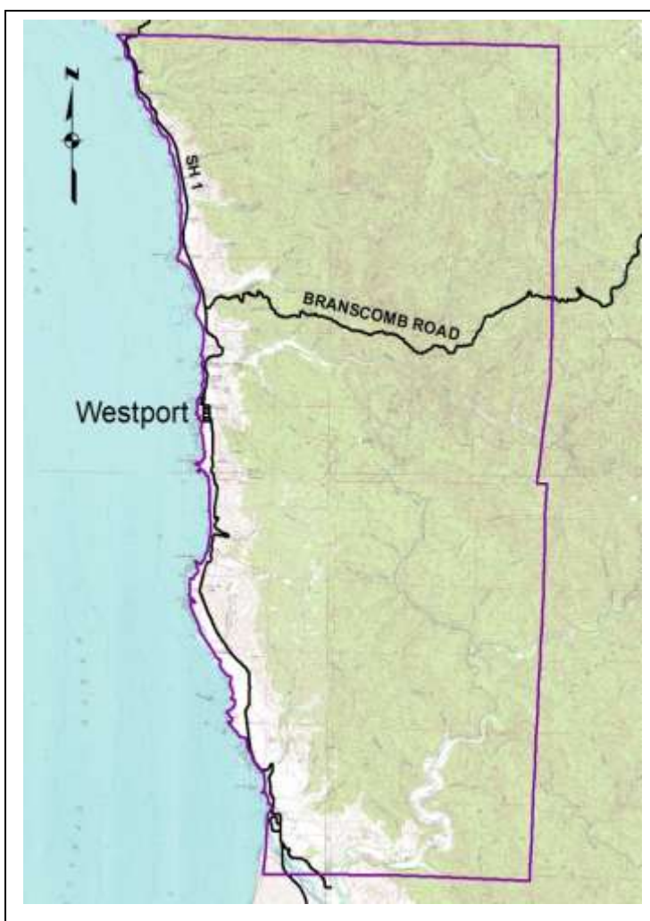
Membership area for the Westport Church