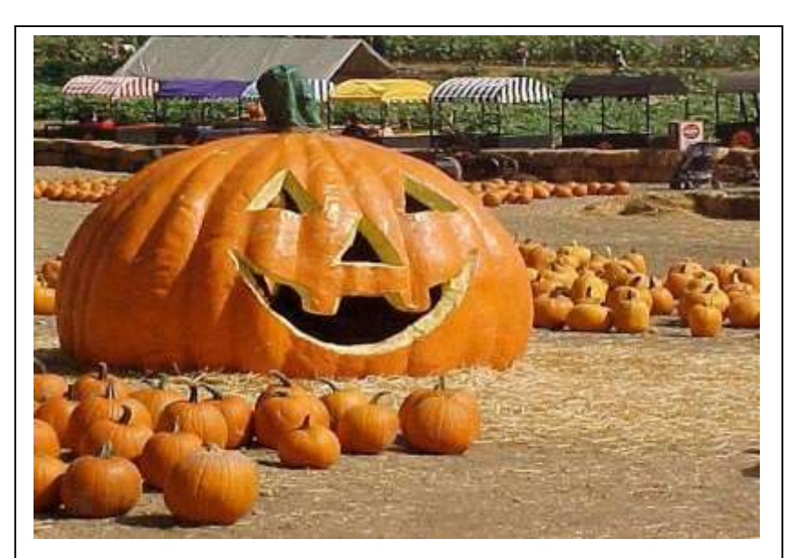
HAPPY WESTPORT HALLOWEEN! (see page 4)