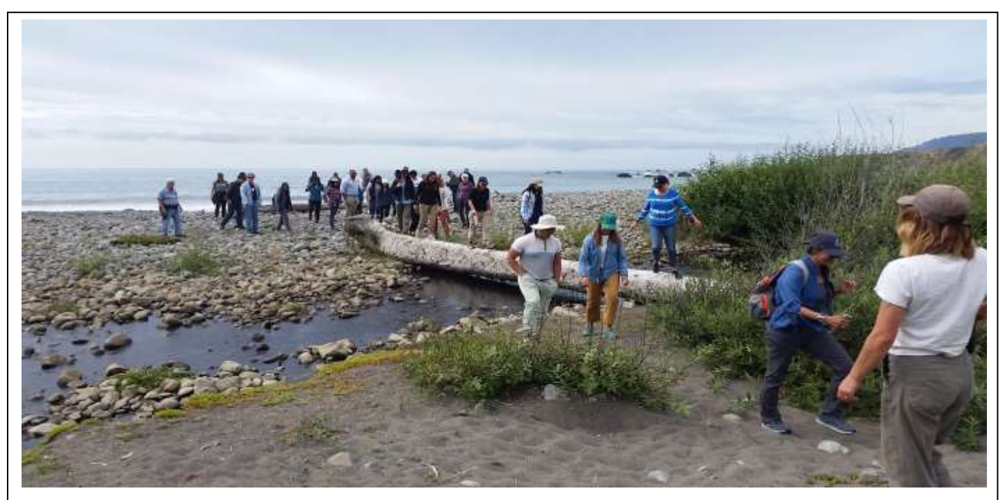
Conservancy and local supporters touring DeHaven Beach on September 21<sup>st</sup>, 2022.