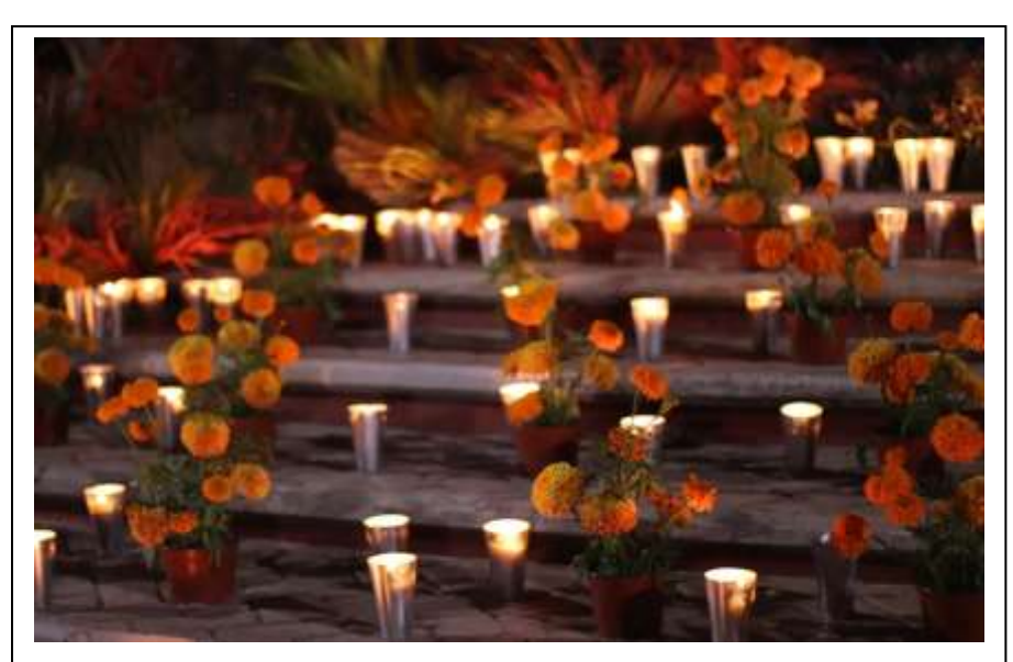
Honor our dear departed at the Westport Cemetery November 5th