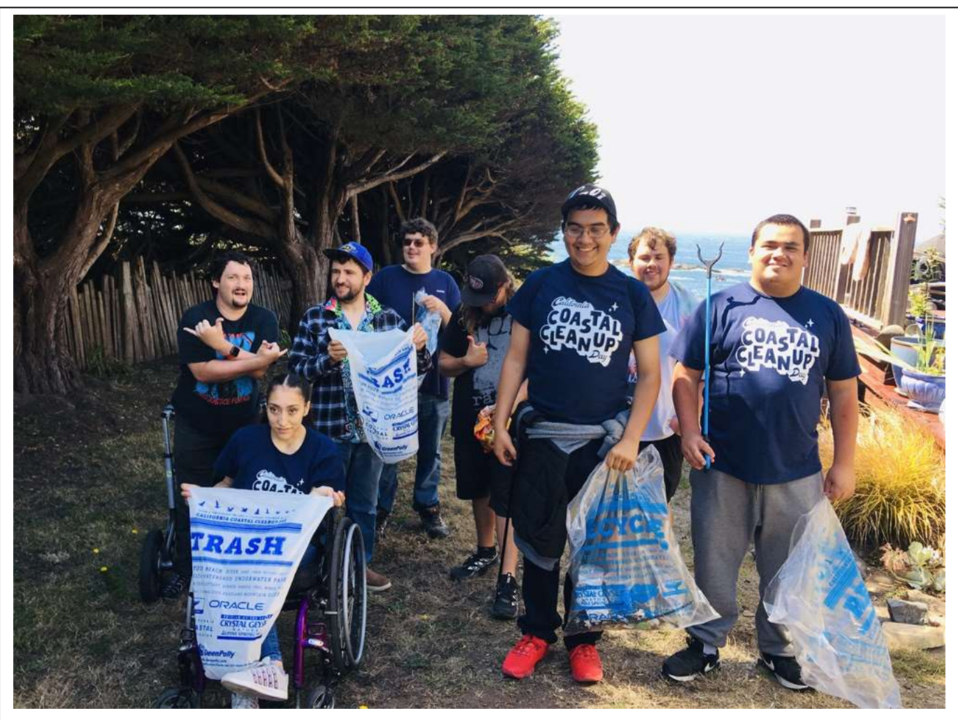
Another successful Westport Clean-up Day!