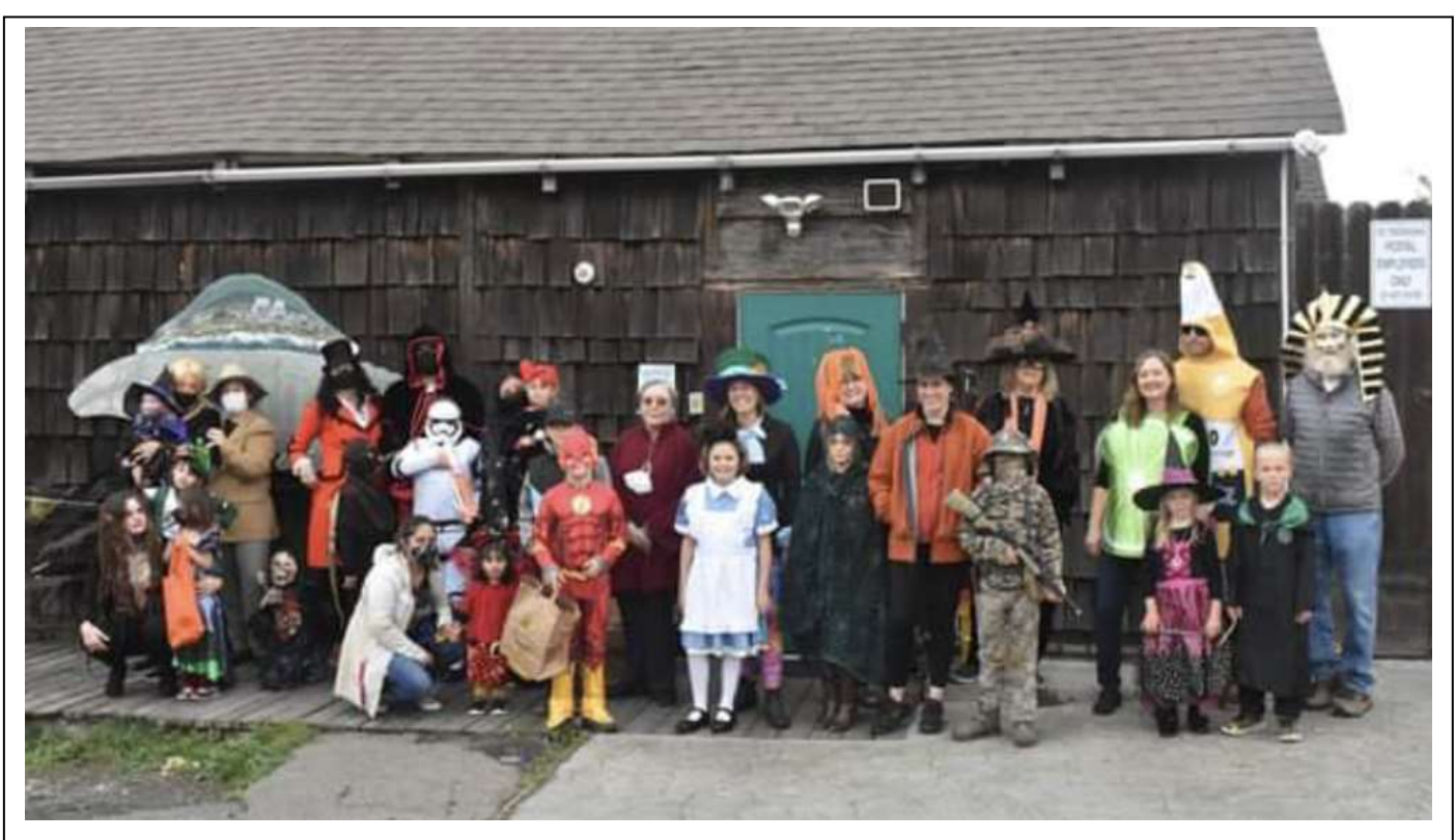
Celebrate Halloween in Westport! (at last year's Westport Halloween festivities)