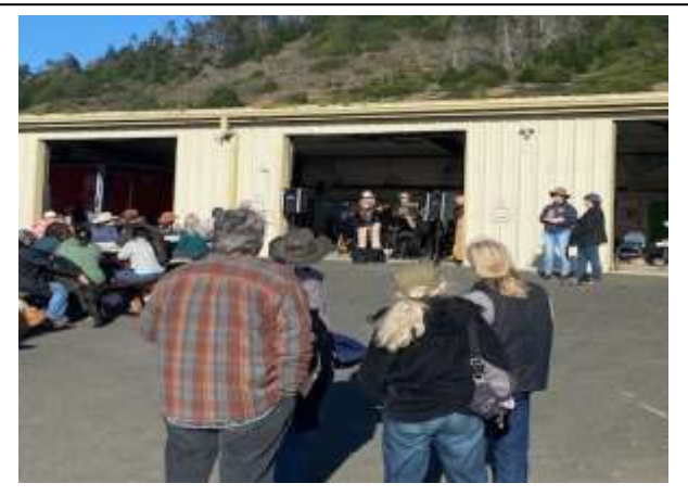
Oct.22<sup>nd</sup> Oktobeerfest

The Westport Volunteer Fire Department also raised some much-needed funds. We are very grateful for the support of our community which enables us to continue providing year-round 911 emergency response service on the northern Mendocino Coast.