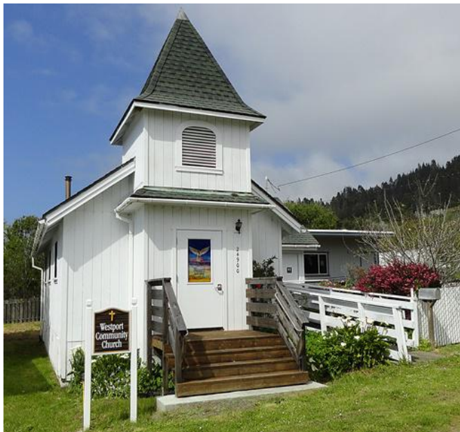
The Westport Church

“Without suffering, you cannot grow. Without suffering, you cannot get the peace and joy you deserve. Please don’t run away from your suffering .”