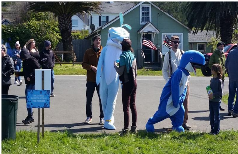
Successful Westport WhaleFest on March 25 th !