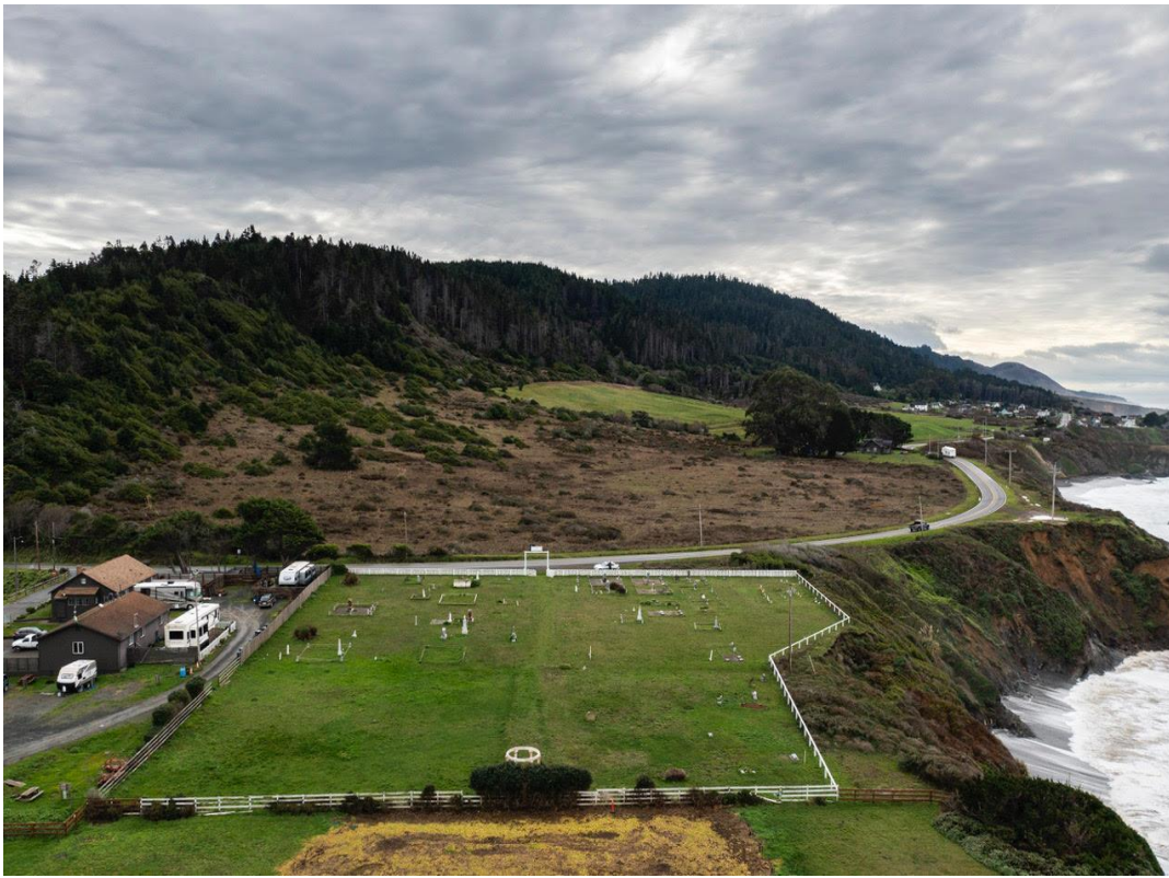
Westport from Cemetery Looking South to Town (upper right). Photo by Nelsen Brazill, December 2023.

Thursday, July 10 th – Full Moon, 1:36PM