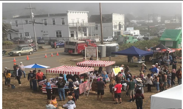
2025 WVFD Fundraising BBQ is Saturday, August 16 th !