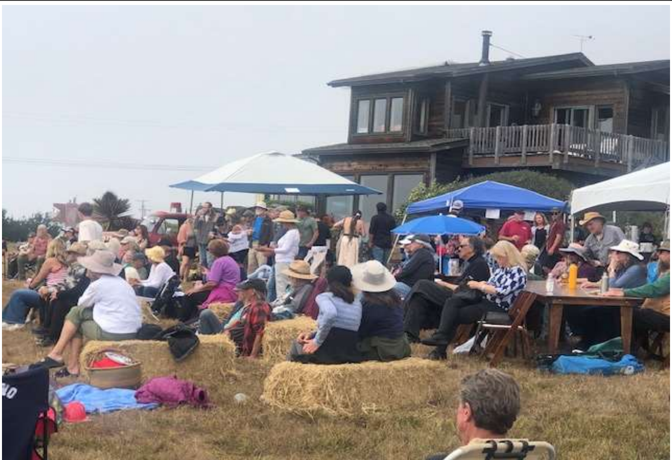
WVFD BBQ

fire engine that should be in service by the end of the year, thanks to a grant from the State of California supporting small volunteer fire departments in northern Mendocino and southern Humboldt counties. We appreciate the contributions by the members of the bands and the many volunteers who made the event a success, and are very grateful for our community's ongoing support.