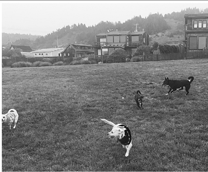
Westport Dogs at play.