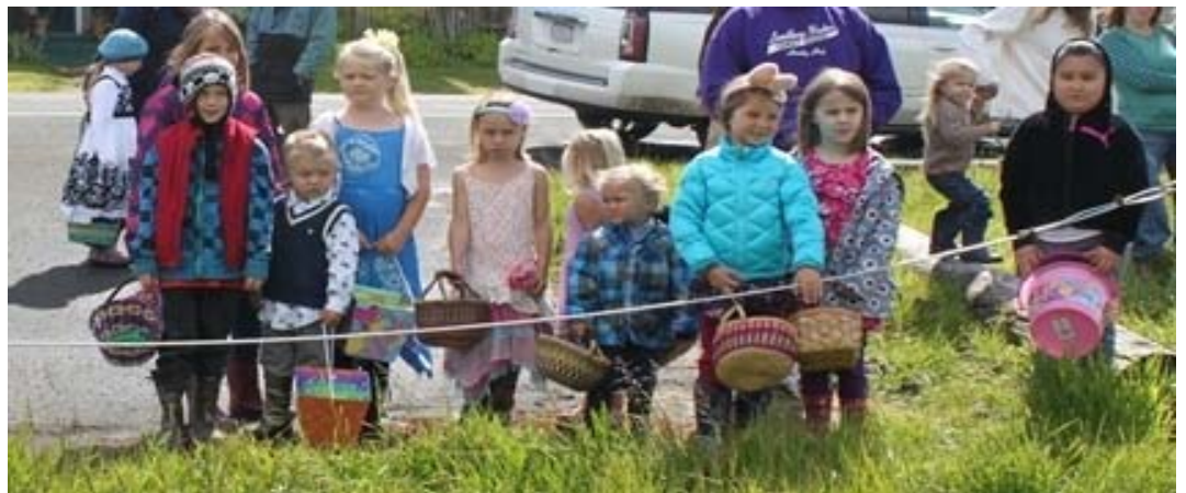
Our Annual Westport Headlands Easter Egg Hunt is on March 27 th (see page 5).

http://www.westportmac.org/next_meeting.jsp