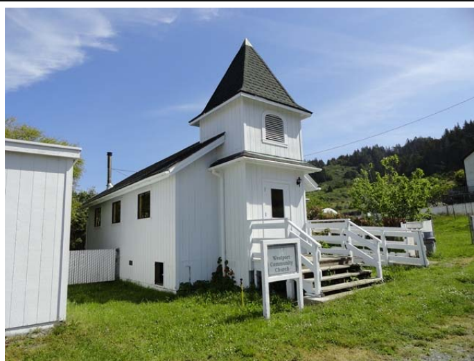
The Westport Community Church