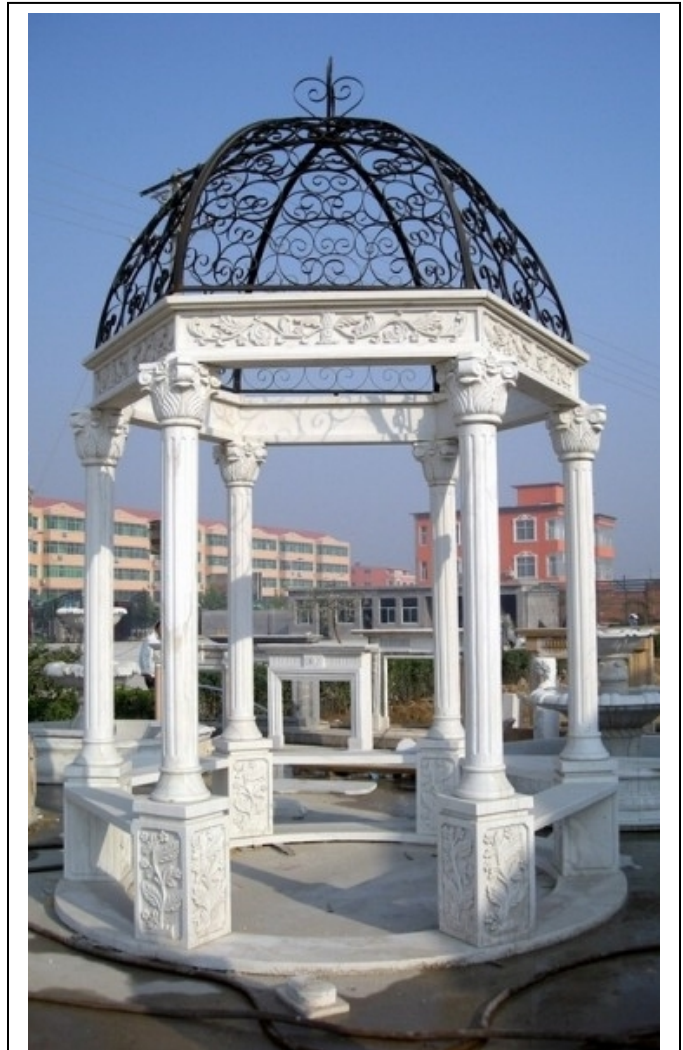
New Monument for the Westport Cemetery?