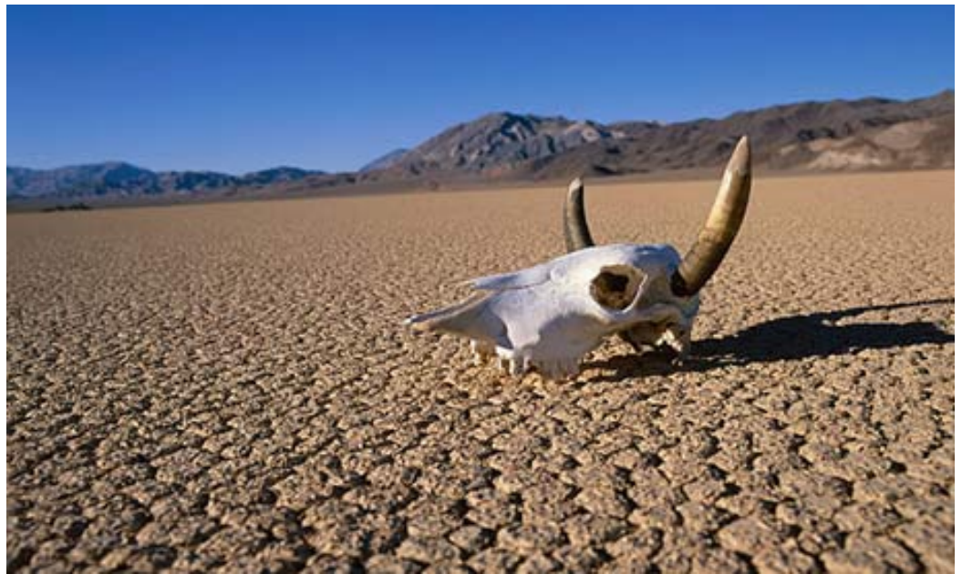
New "Super El Niño" forecast for California, with simulated ensuing landscape. (Well, maybe not – it could still rain. Aw, who knows anymore anyway...)

For months now, everyone has been saying that this "Godzilla" El Niño was "too big to fail". Amidst dire predictions, we in California all watched and waited for the deluge to begin. Even when nothing really major happened in December and January (especially in Southern California), there was always February – that was the real big wet month in the 1982-83 El Niño, which this 2015-2016 model was beginning to resemble most of all). But now February is gone, and instead of El Niño, all we've gotten is El No-no. Hey, we're running out of rainy months here!