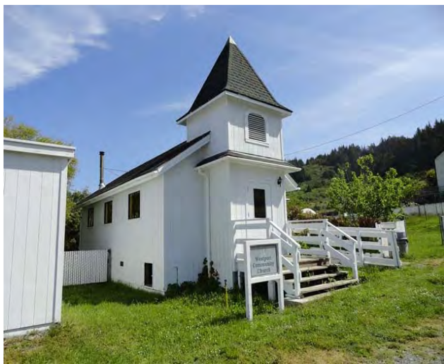
The Westport Community Church