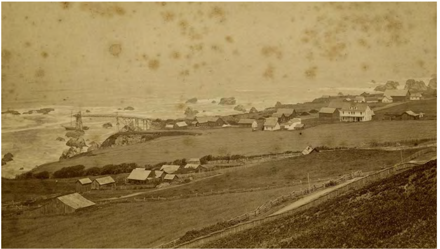
This view of Westport from the southeast, 137 years ago, shows a thriving new town with a functioning pier!