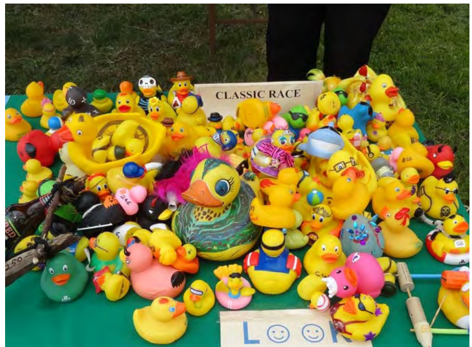
Our Ducks Will Be Ready To Go On May 10th!

The drought is affecting the water level in Wages Creek, but thank goodness we have creative Course