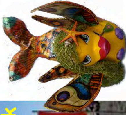
Decorated Duck Contest