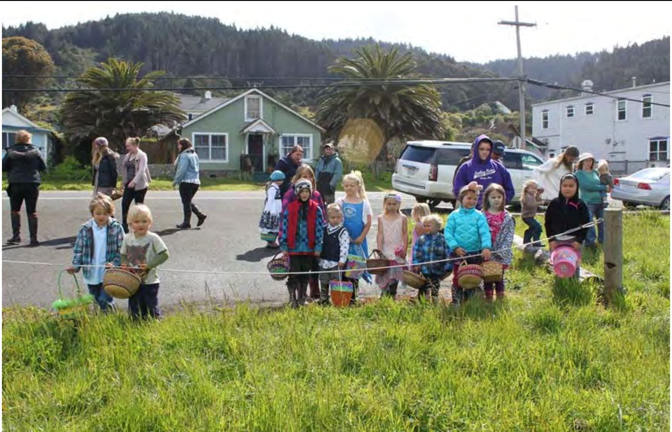
We're All READY! – for the Great Westport Easter Egg Hunt!