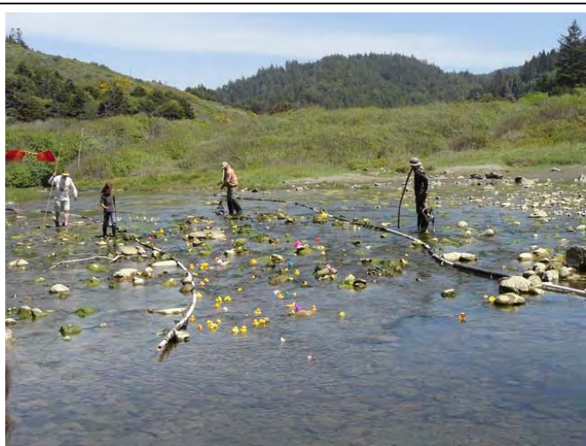
The 2014 race featured rocky rapids at the start.