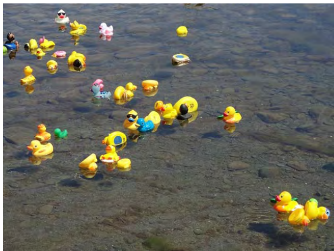
It's the Classic Race, and the Ducks are in the water!