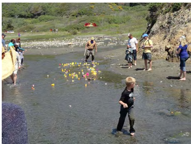
The Yellow Flag is lifted, and the Race resumes at a rapid pace on the downhill stretch!