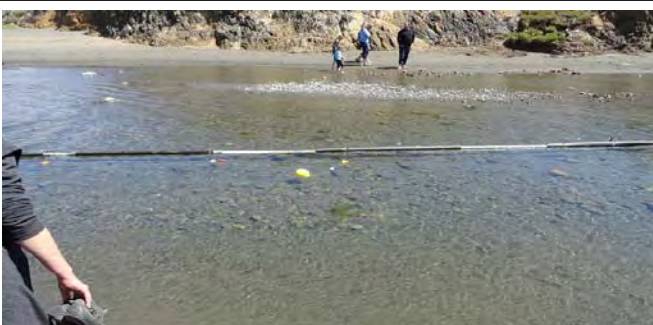
Hey, That’s Not A Duck, and it’s in second place!

Folks who have been racing rubber duckies for a long time (and we’ve got a lot of them in these parts) know that a fast course favors a different kind of duck than a slow course does. It all has to do with specific gravity and the speed of the current. In this year’s featured Classic Race (see photos), the winner was very fast down the stretch, even though it was a real lemon. No, I mean that seriously – it was a real lemon (even though it looked kind of like a duck!) There are evidently no rules against fruit in the Classic Race!