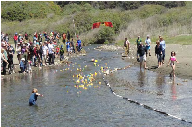
The Ducks Are In The Water For the Classic Race!