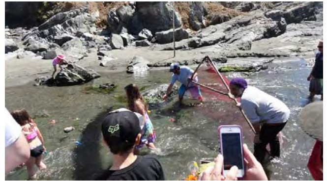
It was a fast finish – and the winner is...