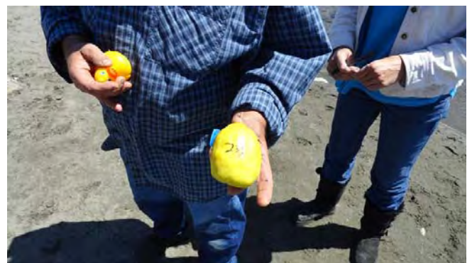
By 16 lengths, it’s #233 – LIMON!