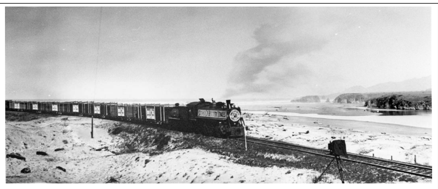
Ten Mile Railroad, 1931